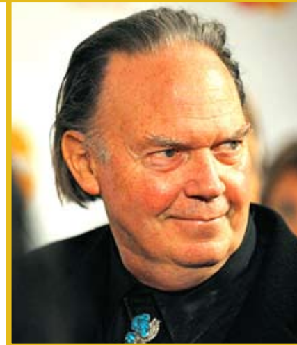
Neil Young was honored as the MusiCares Person of the Year.

Banton, 36, was up for a best reggae album award for his Rasta Got Soul release at the Grammys last night. He is currently in jail in Florida