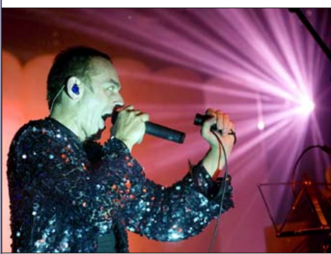
The night is but young.