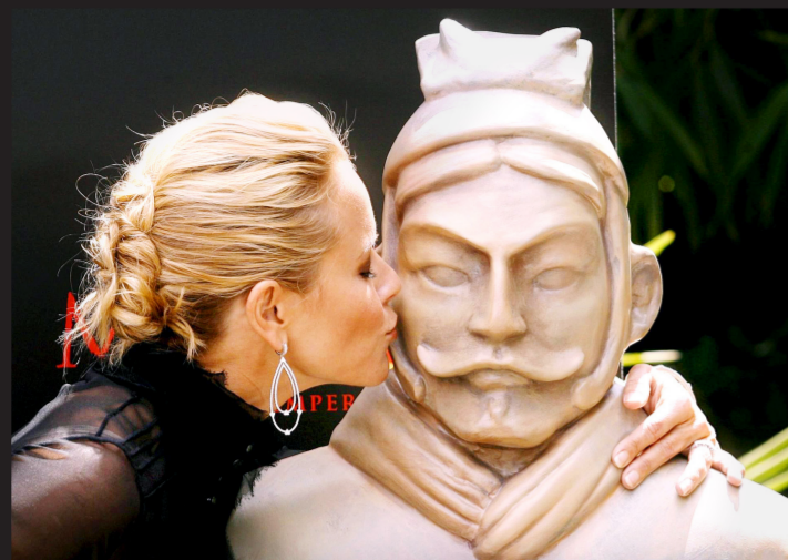
US actress Maria Bello kisses a terracotta warrior sculpture as she presents her film The Mummy: Tomb of the Dragon Emperor last month in Madrid. The movie by US director Rob Cohen is the third film of the saga after The Mummy and The Mummy Returns.

Will the new 'Mummy' flick hurt Maria Bello's hard-won reputation? Not to worry, she has a gold shoe to protect her