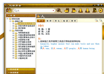
Dr Eye's Han Easy 1.0.