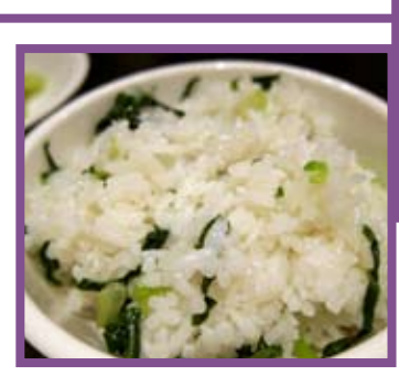
wonderfully with Guangsheng's menu of classic dishes.

Retro chic and political kitsch aside, Guangsheng's Shanghai cuisine, served in individually sized set meals, is very good. Even the side dishes included with each set, which vary from day to day, are thoughtfully prepared. On separate visits, I had tender stewed melon topped with a single clam, soup made from sweet corn and Job's tears, and bean curd garnished with thinly sliced scallions. You get a choice between plain white rice and caifan (菜飯), or lightly seasoned rice mixed with diced vegetables. The latter is delicious and pairs