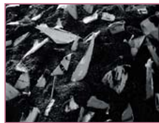
Cheng Sung-chih, Untitled — Daily Sculptures (detail) (2010).