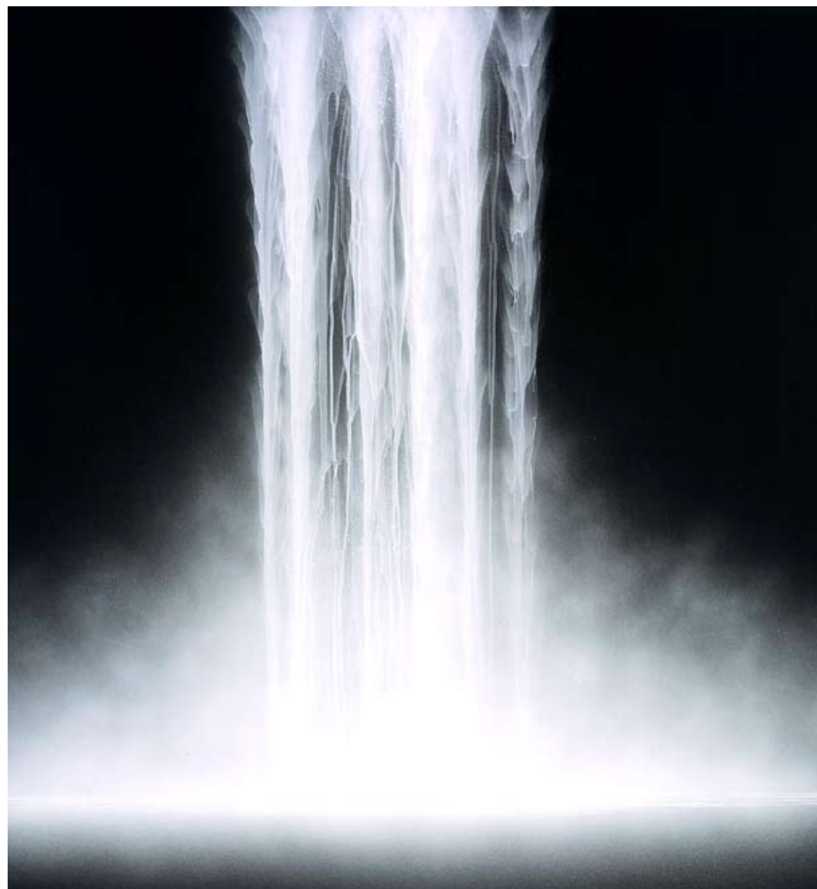
▲ Hiroshi Senju, Day Falls/Night Falls (2007).