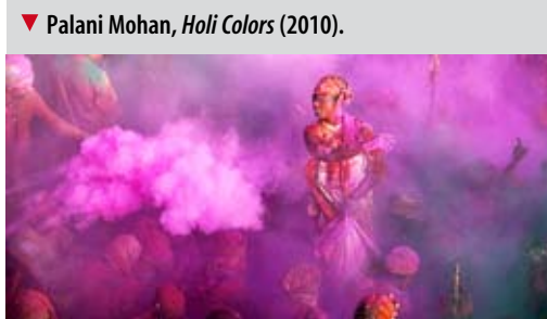
▼ Palani Mohan, Holi Colors (2010).