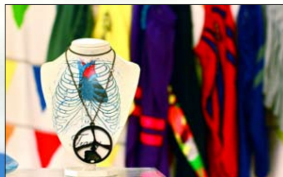
Eureka! eureka! eureka! sells avant-garde designs by Taiwanese designers and retro-inspired imports from Thailand.