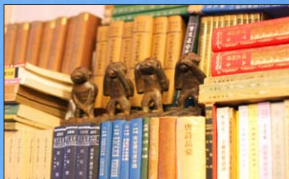
Secondhand, antique and collectible volumes line the shelves at JXJ Books.