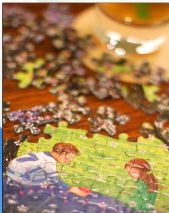
Enjoy an iced tea and puzzle at Cafe Puzzle Caffeine.