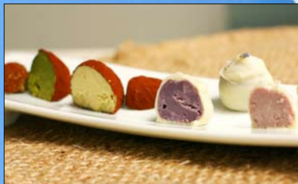
Is Taiwan, Is Chocolate specializes in treats by Taipei-based confectioner Henry & Cary.

Founded more than 30 years ago, JXJ Books specializes in rare and collectible tomes, as well as secondhand books on art, culture and history. The well-lit space looks like a homey but well-appointed library, with cushioned seats, vintage furniture and baskets of English-language novels and nonfiction books to dig through.