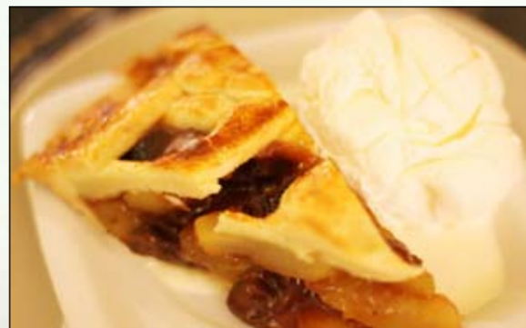
A slice of apple pie a la mode at My Sweetie Pie.

With its broad tables and artfully decorated interior, Insomnia (睡不著) at 13, Ln 93, Shida Rd, Taipei City (台北市師大路93巷13號), tel: (02) 2364-0002, is an ideal spot to get in some late night (or daytime) studying. Cafe Bastille at 23, Ln 40, Taishun St, Taipei City, (台北市泰順街40巷23號), tel: (02) 2369-9728, is renowned for its selection of Belgian beers. Run by the same people as popular restaurant Grandma Nitti's, My Sweetie Pie across the street at 3, Ln 93, Shida Rd, Taipei City (台北市師大路93巷3號), tel: (02) 3365-3448, specializes in luscious pies, cakes and other baked goodies like bread pudding.