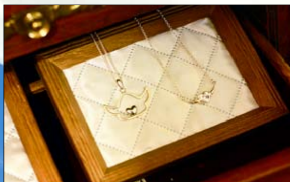
Sweet but chic jewelry is a Georgia Tsao signature.