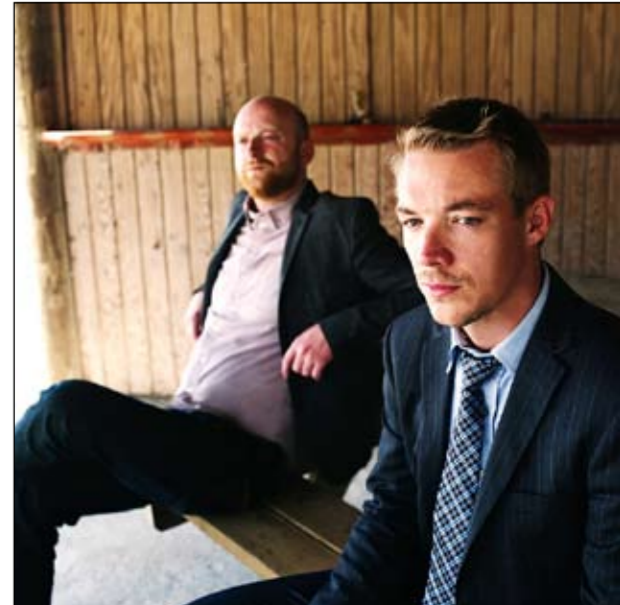
Inflatable animals optional.

Major Lazer, Wednesday from 10pm to 4am at Luxy , 5F, 201, Zhongxiao E Rd Sec 4, Taipei City (台北市忠孝東路四段201號5樓). Admission is NT$500 (women) and NT$900 (men) at the door. Advance tickets are NT$300 (women) and NT$600 (men), available from both Toasteria (吐司利亞) locations, 2, Ln 248, Zhongxiao E Rd Sec 4, Taipei City (台北市忠孝東路四段248巷2號), tel: (02) 2731-8004, and 1, Ln 72, Yunhe St, Taipei City (台北市雲和街72巷1號), tel: (02) 2365-3051, and KGB, 5, Ln 114, Shida Rd, Taipei City (台北市師大路114巷5號).