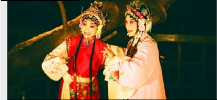
Sauntering in the garden.

Lanting Kun Opera Troupe's (蘭庭崑劇團) post-modern reworking of Quest for the Garden Saunter and the Interpreted Dream (尋找遊園驚夢) , based on a highly regarded experimental 90-minute performance installation designed for Huashan 1914 Creative Park (華山1914) in 2007, will premiere at Taipei's Metropolitan Hall (城市舞台) tonight. The opera is inspired by Ming Dynasty author Tang Xianzu's (湯顯祖) Peony Pavilion (牡丹亭), one of Chinese culture's preeminent romantic works. Today and tomorrow at 7:30pm and Sunday at 2:30pm Tickets are NT$400 to NT$2,000, available through ERA ticketing or online at www.ticket.com.tw