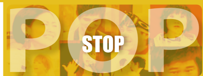
Angelababy: the next Cecilia Cheung?

Chou's record company, JVR Music (杰威爾音樂), if the Double-Js get really friendly with each other.