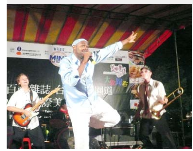
The Money Shot Horns headline this year's Compass Taichung International Food and Music Festival.

The Compass Taichung International Food and Music Festival highlights the international dining and music scene in the middle of Taiwan