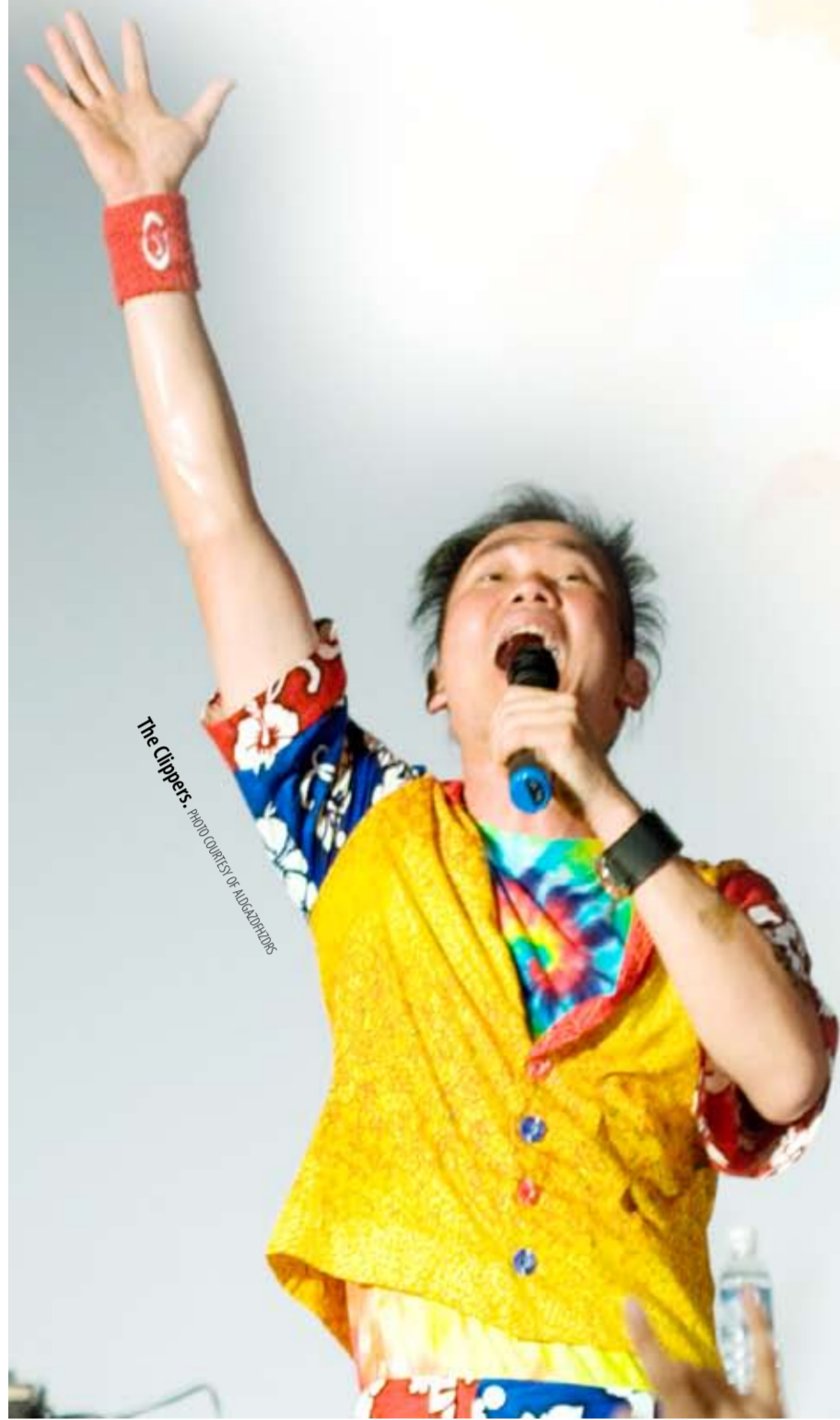
The Clippers

For tips and travel information for this year's Spring Scream, see Page 14.