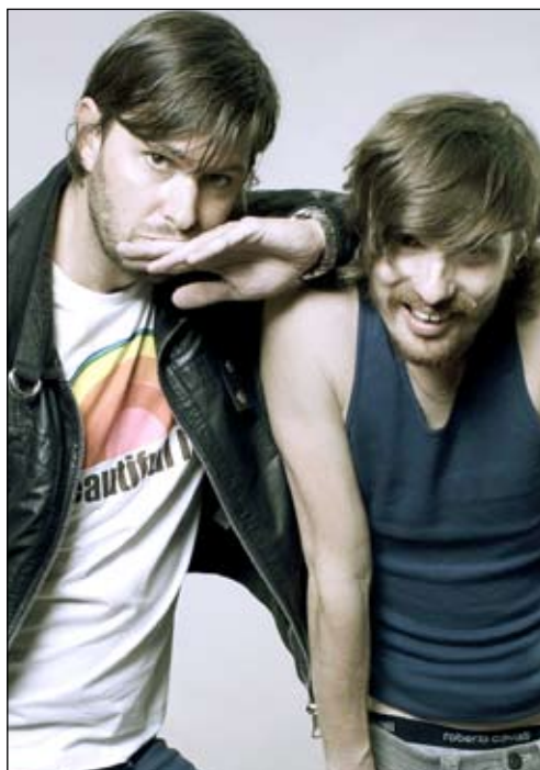
Italoboyz are in town tomorrow at Barbados.