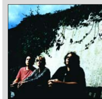
Yo La Tengo returns to Taipei for a show at Legacy Taipei tomorrow night.