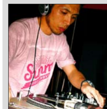
Legacy drops some bass at Underworld tonight.