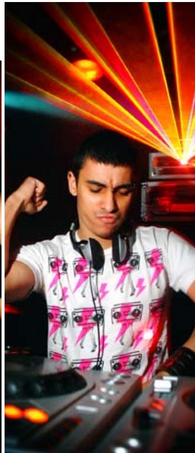
Up Against the Wall at Light Lounge.