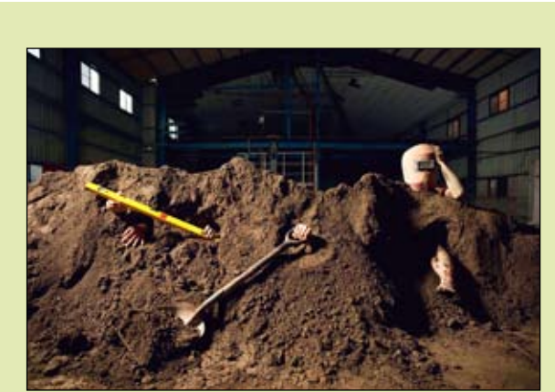
Getting down and dirty.