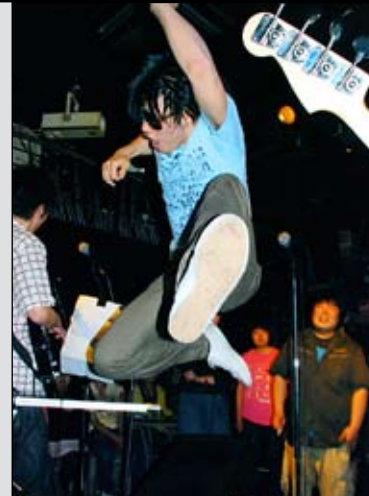
Japanese punks Devcornelius perform at Underworld tonight and APA Lounge 808 tomorrow.

Japanese bands Devcornelius (胖胖小山田) and V/cation come to Taipei for two shows this weekend, one tonight at Underworld (地下社會) and the other tomorrow night at APA Lounge 808 (阿帕808). They will play with Taiwanese band Teention , which is the product of a collaboration between local punk rock record labels Chngin Records and Psychoyouth Records. V/cation is billed as a next-generation Japanese Circle Jerks, and although Devcornelius lists a wide range of influences, from Motown to bossa nova, its music is firmly grounded in hardcore punk. Expect punk, and lots of it with machine gun rhythms, thrashing guitars and screaming vocals. Tomorrow's show at APA Lounge 808 includes the relatively mellow ska and reggae sounds of Down in Air (墜在空中) as well as indie rockers Touming Magazine (透明雜誌), both local bands. ► Devcornelius , V/cation and Teention , tonight at 9pm at