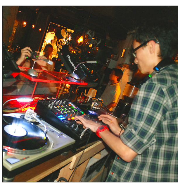
The Plain-man/Bedroom DJ forum, where DJs go to be noticed.

alling all bedroom and up-and-coming DJs. Plain-man/ Bedroom DJ (素人DJ) is a forum run by Shao Shih-wei ▶ (邵詩緯), a passionate muso who's worked in the music industry for seven years, that since February of 2007 has held more than 70 events across Taiwan.