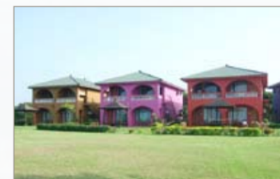
Ba Tsun Villas.