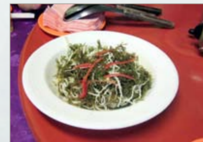
Mixed seaweed and betel nut flower at Hundred Seas Restaurant.