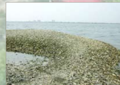
Oyster shell island.