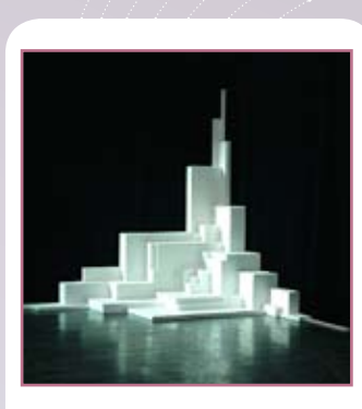
Auamented Sculpture Series is an installation by Spanish new media artist Pablo Valbuena.

Artists from Taiwan, Germany, Japan, Sweden and Spain working in interactive installation, sound and video art will show off their work as part of the Fourth Digital Arts Festival. This year's theme, "Funky Light" (光怪), probes the nature of technology and its effect on civilization. The festival, which takes place at the Museum of Contemporary Art, Taipei (MOCA, Taipei) and the Digital Arts Center (台北數位藝 術中心), is accompanied by a series of performances and an