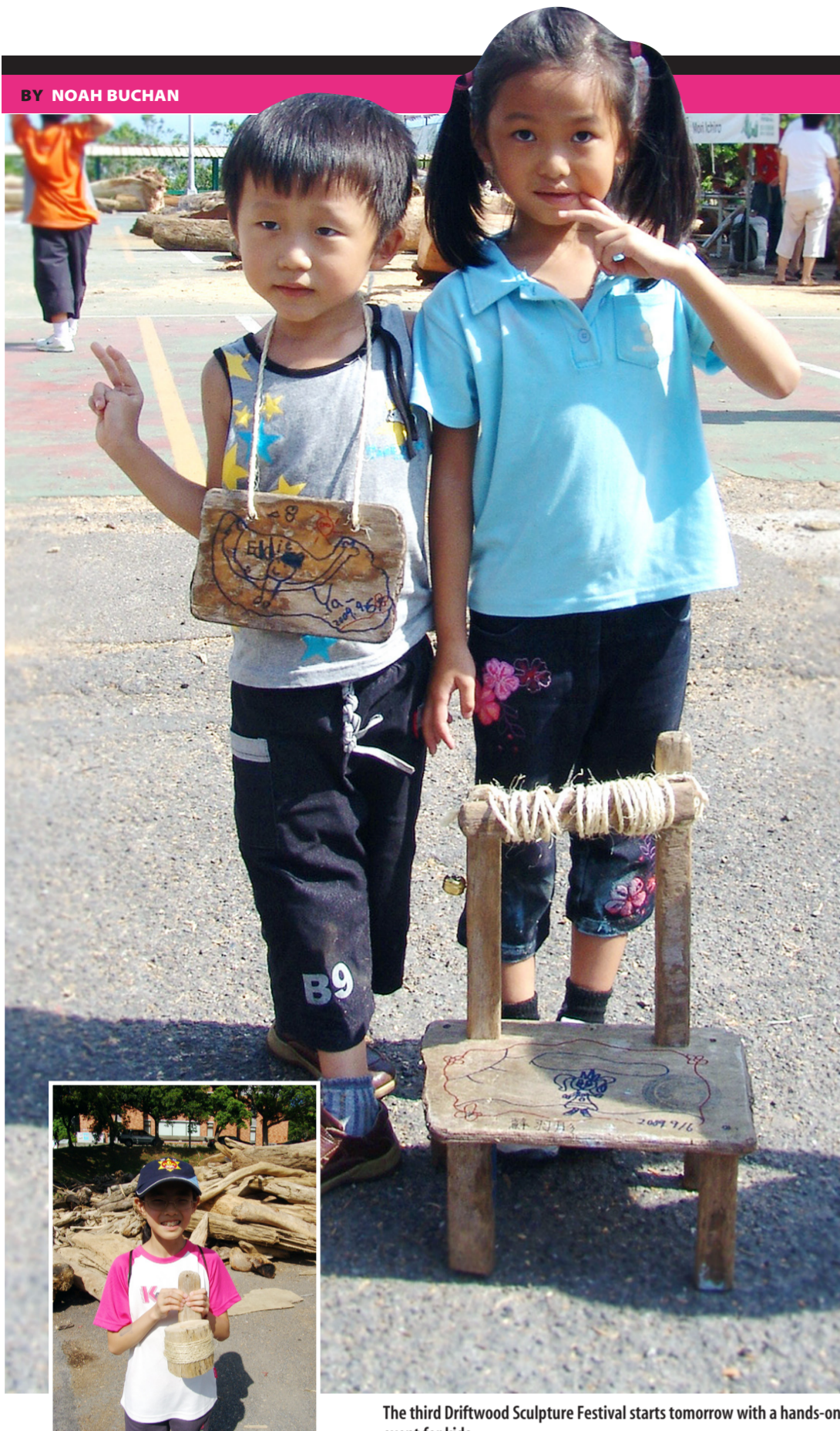
The third Driftwood Sculpture Festival starts tomorrow with a hands-on event for kids.