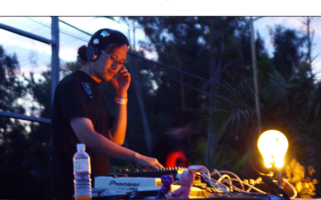
DJ Dragon fights the good fight for psytrance.