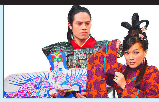
Mulan takes a humorous look at gender identity and love.