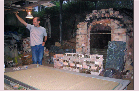
The Taipei Culture Passport opens doors into the capital's soul.