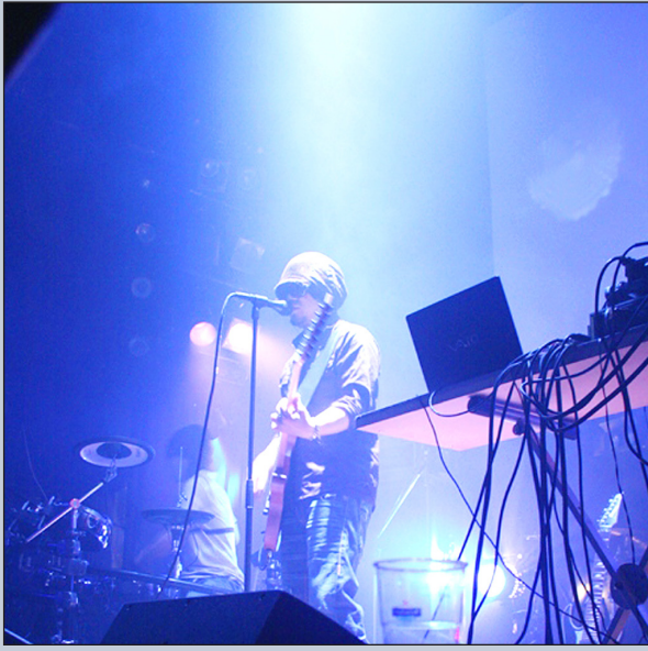
Stinky, scary and scintillating.

The band was established four years ago by T2low