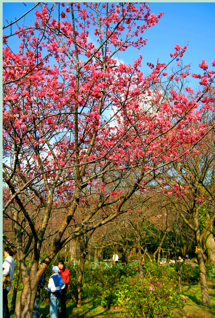
Cherry blossoms are the stars of the show at the Yangmingshan Flower Festival.