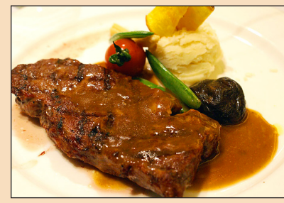
The food never quite gets off the ground at A380 In-Flight Kitchen.

It's noon in Taipei, 5am in Paris and midnight in New York as I take my seat in economy class. The seatbelt and no smoking lights have been switched on and the monitor on the wall shows a plane taking off. A 'stewardess" comes over to take my order. Taipei has seen its