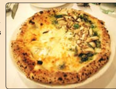
Primo Trattoria's stone-oven baked, Napoli-style pizzas are worth the trip.

Primo Trattoria offers an extensive list of Italian wines (NT$650 to NT$1,000 per bottle). If forgoing alcohol, a couple can get away with a full, satisfying meal for around NT$1,200. On weekends, the wait for a table runs as long as an hour and a half, so it's best to make reservations. — DAVID CHEN