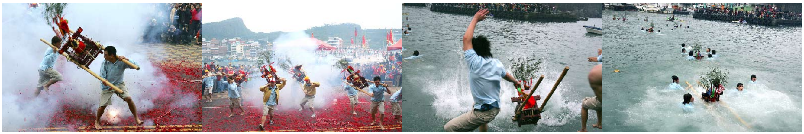
Yehliu celebrates Lantern Festival with a walk over embers and a cold plunge into the harbor.