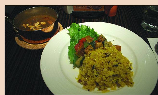
The curry chicken and turmeric rice is a fancier twist on the usual Japanese curry at Danbo Fun.