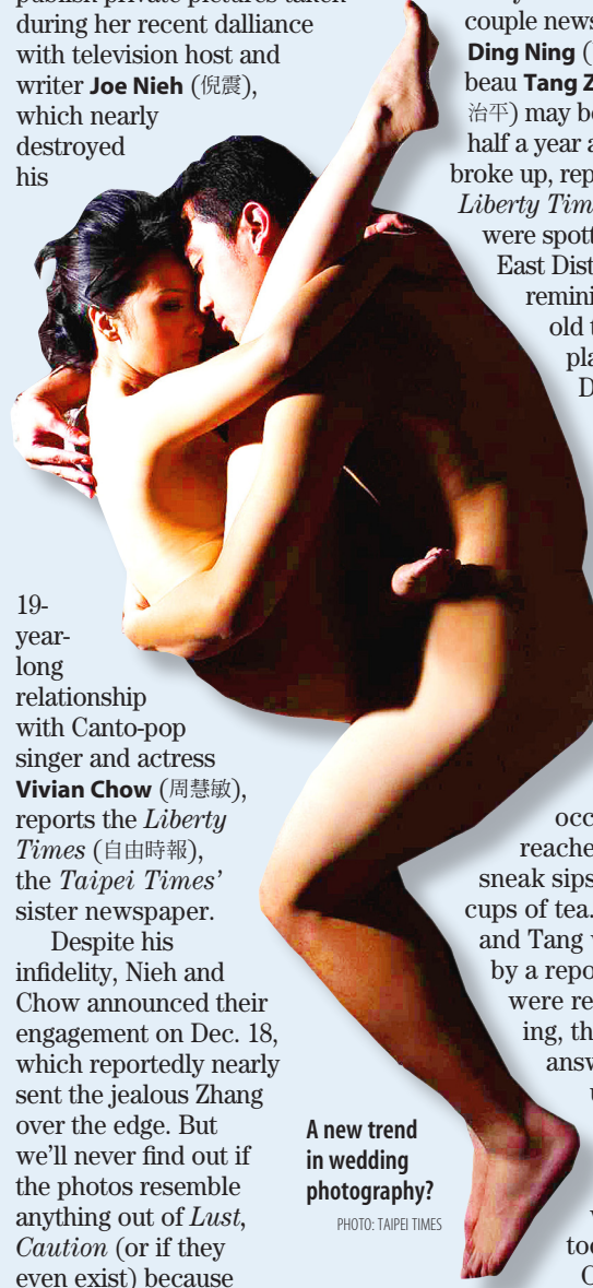
A new trend in wedding photography?

— COMPILED BY CATHERINE SHU AND DEREK YIU PUI-YUNG