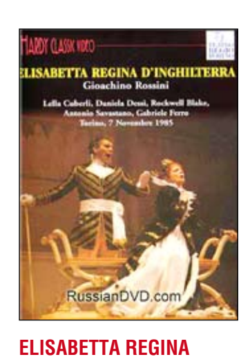
D'INGHILTERRA Rossini Hardy Classic Video HCD 4007