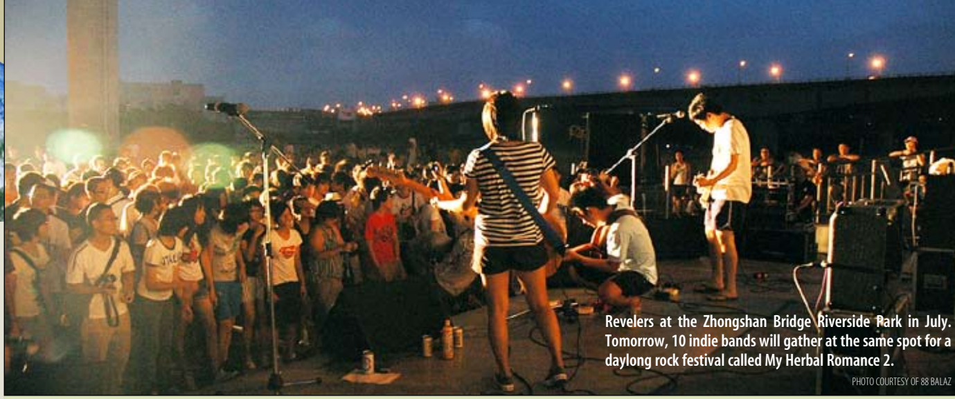
Revelers at the Zhongshan Bridge Riverside Park in July. Tomorrow, 10 indie bands will gather at the same spot for a daylong rock festival called My Herbal Romance 2.

Singer Stanley Huang (黃立行) celebrated the success of his recent album We All Lay Down in the End (最後只好躺下來) by bedding 30 fans, the Apple Daily reported this week.