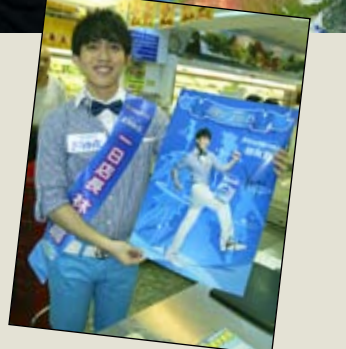
Above: What do Yoga Lin and a party liner have in common? Top: Stanley Huang was almost bedridden earlier this week.

Singer Stanley Huang (黃立行) celebrated the success of his recent album We All Lay Down in the End (最後只好躺下來) by bedding 30 fans, the Apple Daily reported this week.