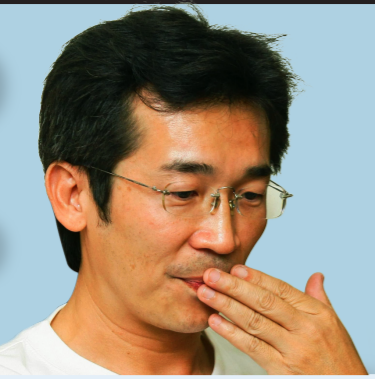
Wei Te-sheng, above, is learning how to be a somebody. Jacky Wu, below right, is a sore winner.

The Golden Bell Awards (金鐘獎) handed out yearly laurels to the kings and queens of television on Friday of last week. Bickering and catfights promptly ensued, giving the world a glimpse into the alliances and feuds among the glitterati.