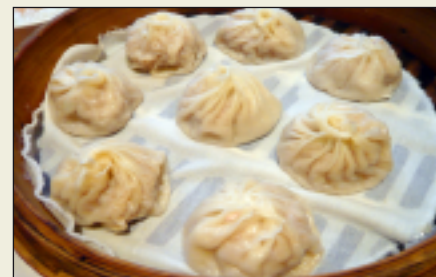
Chinchiyuan's dumplings offer better value than its more famed neighbor Din Tai Fung.

Other dishes which are worth trying include xianrou sujiao (鮮肉酥餃, NT$20 for one), which is seasoned pork wrapped in a crispy, flaky, buttery pastry crust, and dousha xiaobao (豆沙小包, NT$80), or sweet red bean paste in a thick, QQ dumpling skin, and the xiehuang zhengjiao (蟹黃蒸餃, NT$140), which are flavored with the tasty yellow substance that is found under a crab's top shell. Because Chinchiyuan's dishes are so reasonably priced and the dumplings so hearty, it's easy to order too much and emerge feeling uncomfortably overstuffed instead of sated. It's best to exercise restraint and order two steamers of dumplings, along with one or two bowls of soup or congee to share, for groups of two or three people. — CATHERINE SHU