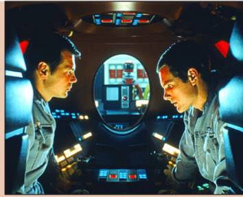
Stanley Kubrick's 2001: A Space Odyssey