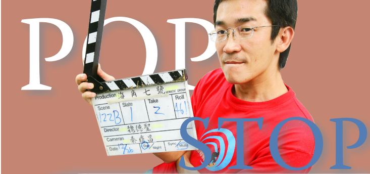
Can Wei Te-sheng save Taiwanese cinema?