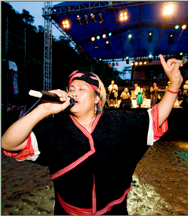
This Amis shaman will appear at Earthfest, a rock festival promoting environmental awareness, which is run by the organizers of Peacefest.