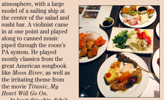
Take your time at the Skyline Buffet, which offers a decent spread and nice views of Taipei.

ON THE NET: Detailed program in Chinese and English at www.treesmusic. com/festival/2008mmf