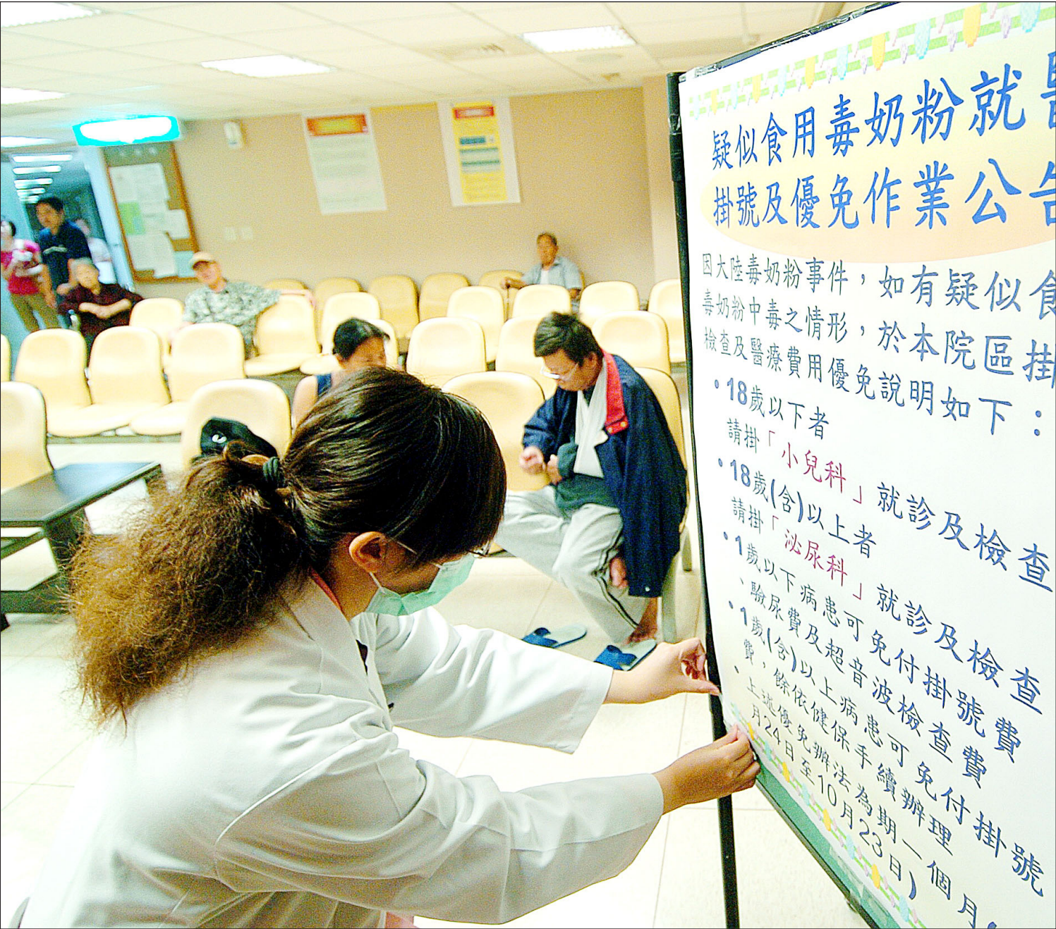
A nurse puts up a notice at the Taipei City Hospital's Zhongxiao Branch yesterday informing the public that the hospital is providing free kidney-stone screening for infants under the age of one residing in the city.