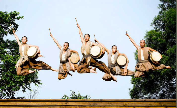
U-Theater dancers take drumming to new heights in The Walk .

longest to date. The Walk features some carefully choreographed segments where