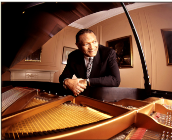
Pianist McCoy Tyner, who made a breakthrough in jazz as part of the John Coltrane Quartet in the 1960s, appears tonight at the National Concert Hall.