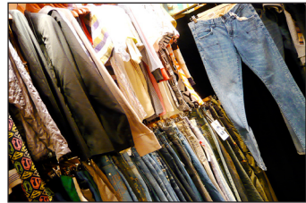
Right On offers jeans and shirts for guys with a casual but hip sense of style.

Shinjuku Plaza offers several stores dedicated to men's clothing for guys who don't feel like sharing their shopping spotlight with the ladies. Right On features a large selection of jeans in a variety of cuts and washes, most of which are imported from South Korea, as well as T-shirts and polo shirts. The casual, hip style of the clothing appeals to a younger crew; shop owner Ryan Lin (林士程) says most of his customers are between the ages of 15 to 30. Jeans are priced upwards from NT$1,380, winter jackets range from NT$1,000 to NT$4,000, and shirts are NT$1,000 and less. Shop hours are from 2pm to 10pm; credit cards are accepted.