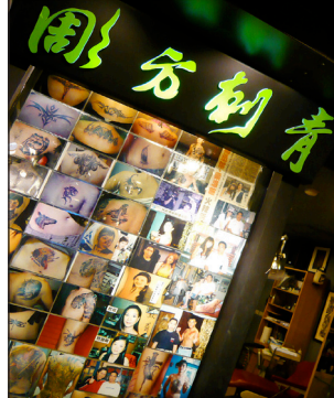
The exterior of Tiao Fang Tattoos showcases the parlor's work.