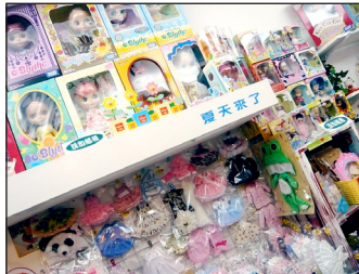
Summertime offers clothes for Blythes and other well-dressed dolls.

Blythe the clothes and shoes, which are mostly handmade by local designers, range from NT$180 to NT$400. Qipaos and kimonos made from lush brocades are NT$750 to NT$820. Blythe doll adoption fees range from NT$2,000 to NT$3,000 (with the exception of limited edition and rarer dolls, which are more expensive). Summertime also has a selection of other kawaii things made by local designers, including handcrafted teddy bears (NT$550) and bear-shaped wallets (NT$350) and keychains in the shape of soft-serve ice cream cones (NT$50). Sassy stickers by Taipei Bremen (NT$40 for an individual decal) will satisfy those who like their cute tempered with a bit of evil. Hours are from 3pm to 9:30pm on weekdays and 2pm to 9:30pm on weekends and holidays; cash only.