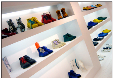
Japanese designer shoes are displayed like objets d'art at EVEN.

EVEN's spare white shelves showcase a well-edited selection of Japanese designer shoes like pieces of sculpture in a gallery. The store is the exclusive Taiwan dealer of shoes from Unibilical and Belly Button, designers with an avant-garde bent. Multi-colored suede loafers from Unibilical are NT$6,800 per pair, while hiking boots in bright, primary solids are NT$10,750 for men's sizes and NT$10,380 for women's. Store hours are from 1:30pm to 10pm; credit cards are accepted.