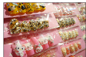
Bling up your hands with nail art at Bella Nails.

If you want to leave Shinjuku Plaza with some brand-new body art but want something a little less permanent than a tattoo, check out Bella Nails. Nail artist and owner Bella Chiang, who studied nail art in Taiwan, Japan and the US, can use acrylic powder in a rainbow of colors, rhinestones, decals, small charms and plain ol' nail varnish to create three-dimensional flowers, bows, lace patterns and cartoon characters on your digits. Manicures start from NT$300 and can go upwards of NT$2,000 depending on the complexity of your design and the materials used; Bella says designs usually average around NT$1,500. Pedicures and foot treatments are also available for NT$700 and up. Hours are from 1pm to 10pm and credit cards are okay with a minimum purchase of NT$1,000. Make sure to call in advance for an appointment.