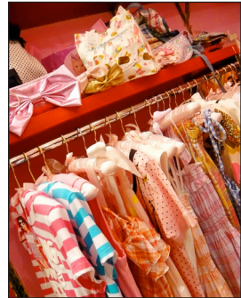
Blink! is truly pretty in pink.

Fans of the Japanese magazine Vivi , whose hyper-feminine aesthetic emphasizes gamine-like layered looks, will feel perfectly at home at Blink! — the shop is painted in several hues of pink, and vintage My Little Pony toys figure prominently in the decor. Cute-as-a-button shop owner Olive Wang (王心美) works with buyers in Japan who send back a colorful selection of T-shirt dresses with oversized stripes, polka-dotted pink blouses, madras drop-waist jumpers, purses with cartoon characters or giant metallic bows, and fanciful shoes (most apparel is NT$2,000 or less). A colorful selection of tights and socks (NT$390 for hosiery from Japan; patterned tights by American brand Celeste Stein are NT$780) are available to complete your look. Blink! is open from 3pm to 9pm; credit cards are accepted.