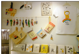
'0416 sells stationary and T-shirts featuring the artwork of (guest who) artist 0416.

The art in the Shinjuku Plaza store is more whimsical than 0416's corporate work. Most illustrations are in marker on mostly white backgrounds; characters include a young girl in a yellow rain slicker rejoicing underneath a rainbow and a man in tighty-whities playing at being Superman with a logo tee and flowered cape. Unisex T-shirts come in a range of sizes and cost from NT$680 to NT$980. Stationary is also available: white spiral-bound notebooks are NT$250 each. Hours are from 2pm to 10pm; credit cards are accepted.