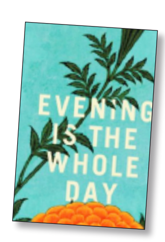
EVENING IS THE WHOLE DAY

BY PREETA SAMARASAN 339 PAGES FOURTH ESTATE