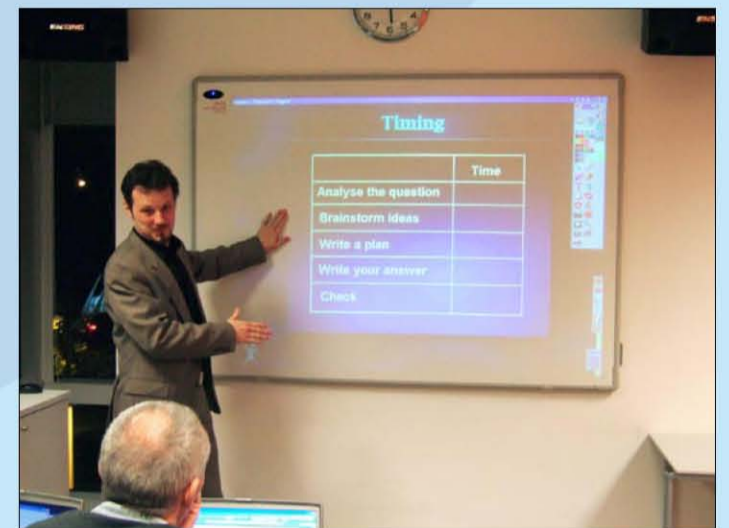
The British Council, Taipei.

▶ E: On the other hand, some people might argue that it is a mistake for children's education to focus exclusively on English, particularly as there are other languages, such as Chinese, Hindi and Spanish, that are spoken by more people. In an increasingly multipolar world other languages clearly have a role to play, for example this week it has been reported that all new foreign executives in China will be required to pass a Chinese proficiency exam. Others would also argue that language represents culture, and that by putting too much emphasis on one language we risk diluting other languages and cultures.